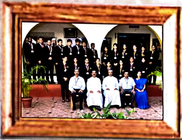
Third Year Batch 2014-2017