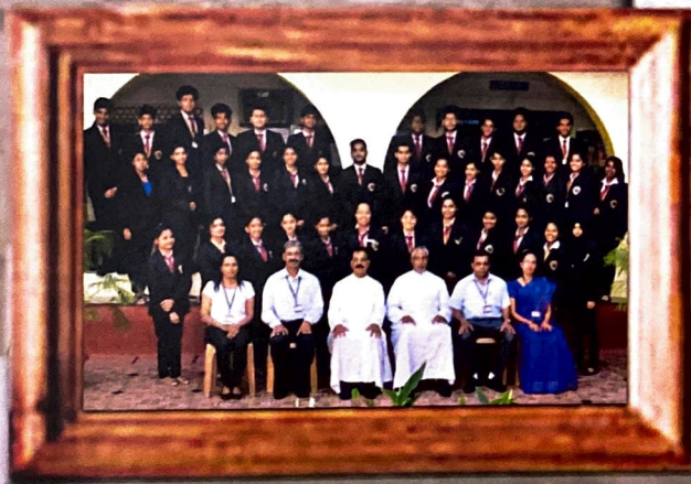
First Year Batch 2016-2019