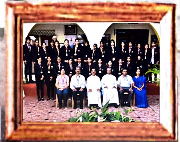
Second Year Batch 2015-2018